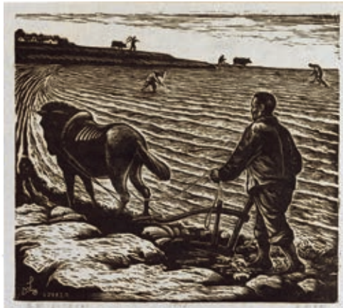
方向 | 春耕 金門風景之二 | 1952·凸版·木版、雕版·29 × 32.5公分·國立臺灣美術館典藏。

Political and economic upheavals caused by the Japanese rule, the end of the World War 2, the imposition and lift of the Martial Law, and the dawn of democracy that unfolded within one century gave birth to the unique cultural scene of 20th-century Taiwan. Despite being merely a branch of the vast genres and subject matters of Taiwanese art, Realism has the ability to truthfully reflect artists’ observation of society and social awareness, as well as the changes throughout Taiwanese history. Under the principle of truthfully depicting life, laborers naturally become an important subject matter for Realism. Either through singing the praises of the sublimity of labor or acknowledging and witnessing laborers’ suffering with compassion and empathy, artists reveal the imbalance and inequality of social systems. There are mutual influences and interactions between society and art; from the first generation of painters’ concern for society under Japanese rule, to the post-war woodcuts printmakers’ affection toward Taiwanese culture and documentation of the real life of the social underprivileged through the photography works of the 80s and 90s, artists display their focus on the existential meaning of human beings and seek to express their beliefs and impact society through their works.