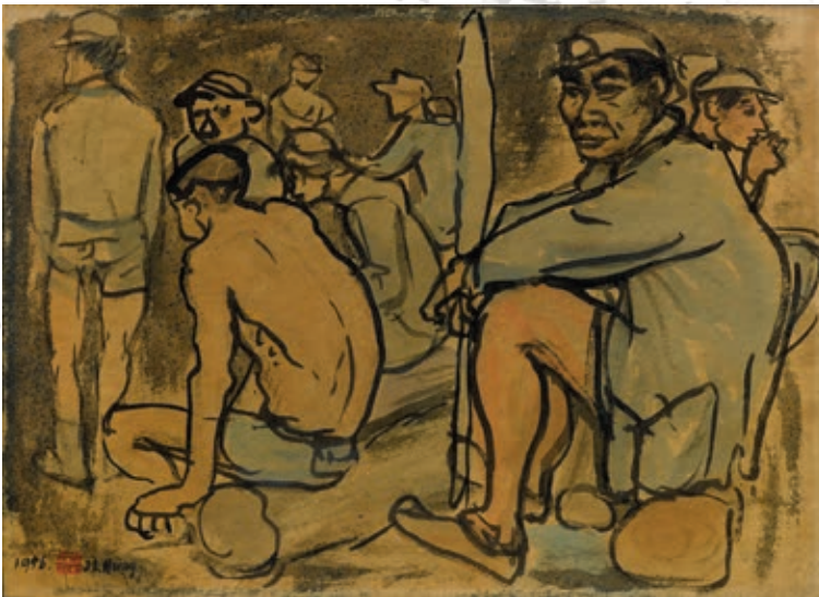
洪瑞麟 | 等待 | 1956·水彩·紙本·38 × 53公分·國立臺灣美術館典藏。