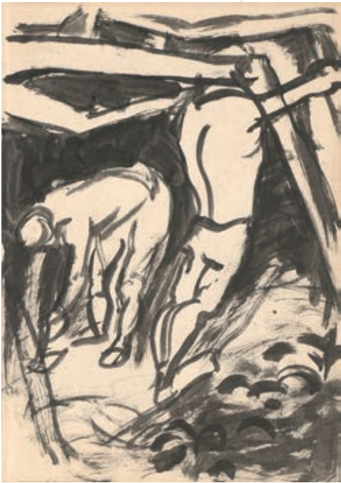
洪瑞麟 | 礦工(164) | 1950年代·水墨·紙本·34.9 × 27.1公分·文化部典藏。