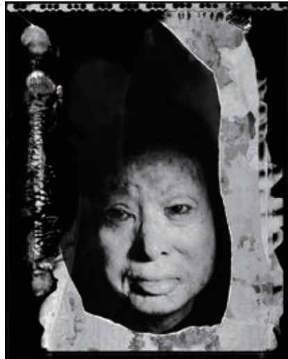
何經泰 | 意外傷了我·醫生誤了我(江來明) | 1995·純棉含銀相紙·127 x 100公分。