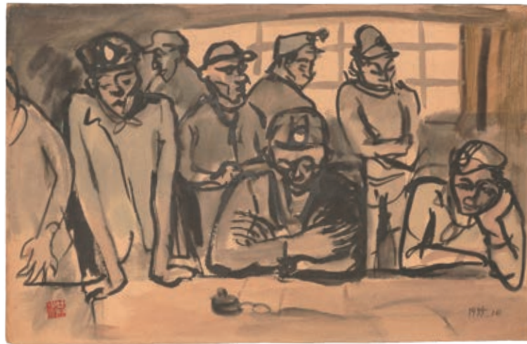
HUNG Jui-Lin, Miners 108 , 1955, ink and color on paper, 27.8 × 42.7cm, collection of Ministry of Culture.