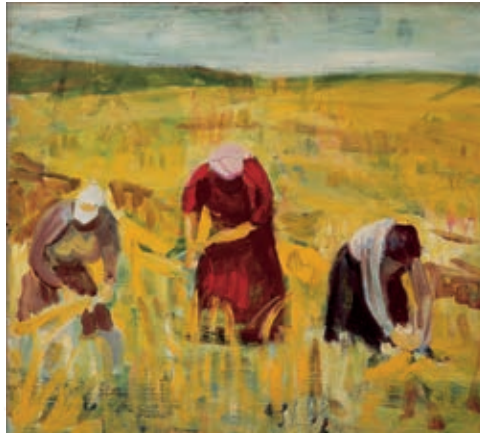
吳耀忠 | 拾穗 | 創作年不詳·油彩·三夾板·38 × 46公分·國立臺灣美術館典藏。