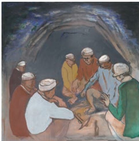
HUNG Jui-Lin, Portrait of the Miner—Khun-á-peh , 1958, watercolor on rice paper, 53.5 × 38cm, collection of Ministry of Culture.